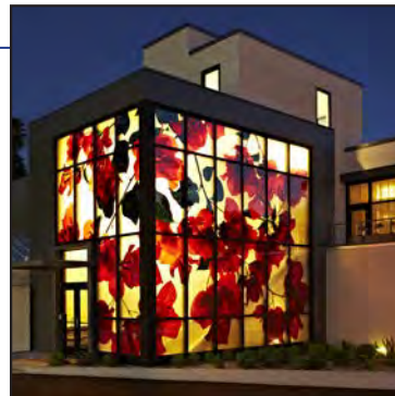
The chic Bel Air Bar + Grill (on Sepulveda Blvd. near Moraga).